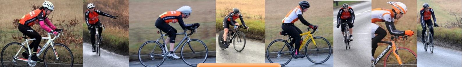
CCS riders on the Mad March Hilly