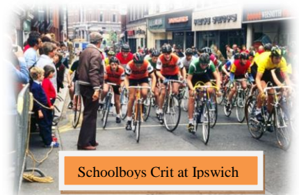
Schoolboys Crit at Ipswich

cameras, I lined up in the schoolboy race alongside everyone else. It was 16 laps of an industrial estate covering 10 miles in total. Everyone else seemed far more experienced than me and as soon as the flag dropped they all shot off round the first corner. I pressed on the pedals as hard as I could but