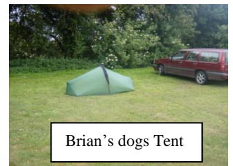
Brian's dogs Tent

Bed by 10:30pm and up again by 5:00am to see off the riders at 6:00am. 54 riders started out, everyone spinning effortlessly in the drizzle except Steve