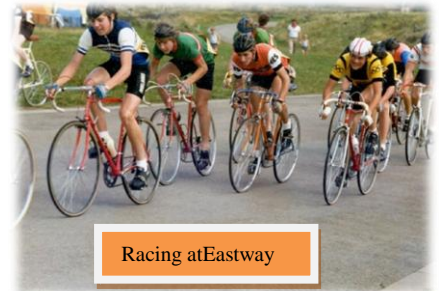
Racing at Eastway

But it was racing at Eastway I loved most of all, and in July I was lucky enough to win my first race there in the Finsbury Park CC meeting which turned out to be the club's first win in an