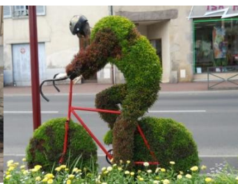
Holiday pics from Issoire – Start town, Stage 9 Tour de France. Anyone fancy a new trend in hedges.