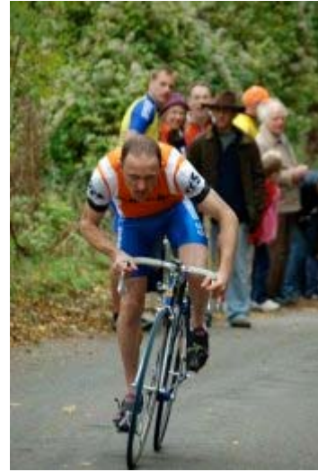
I was well chuffed with my ride, only 1.2secs off my lifetime best for Semer.